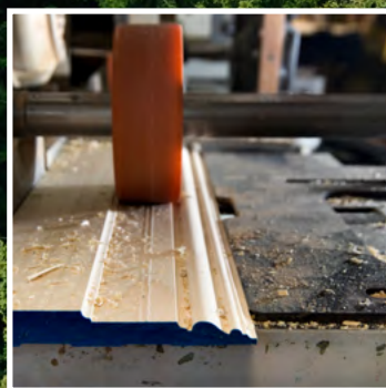
MILLWORK & CABINET SHOPS