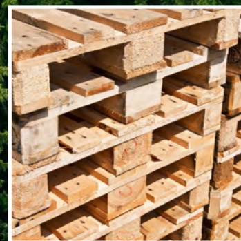
PALLET MANUFACTURERS & RECYCLERS