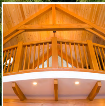
SPECIALTY WOOD PRODUCT MANUFACTURERS